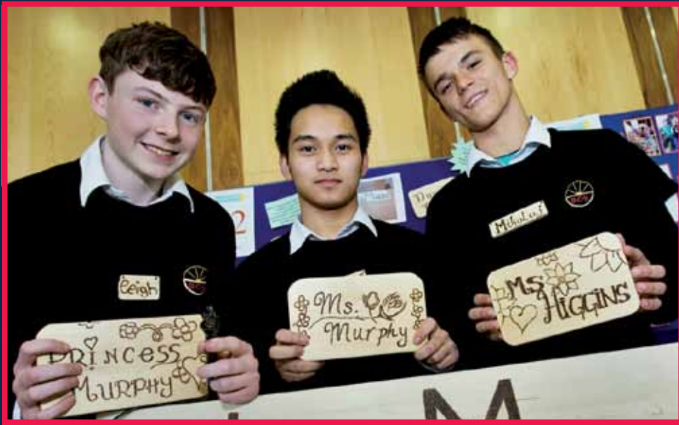
Students Participating in the Student Enterprise Awards (SEA) - DLR County Finals 2011